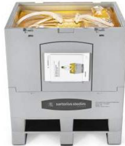
Flexel® 3D Bag and Palletank® BioWelder® TC