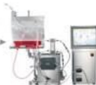
Affinity Chromat. Capturing Step