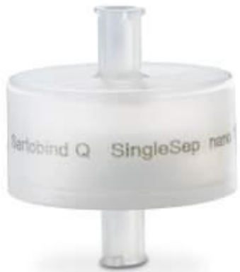
Sartobind Q Single Sep® nano