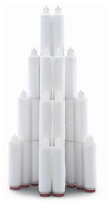
Membrane Filter Cartridges