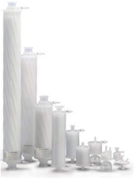
Membrane Filter Capsules