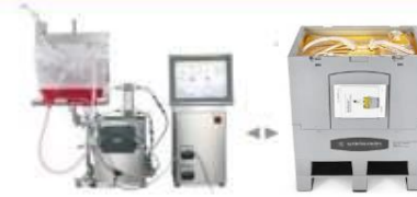
Crossflow Volume Reduction | Recirculation