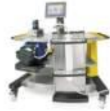
Monitoring & Control